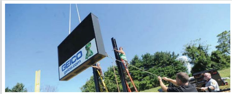
Display for Miracle League of Northampton County Installation