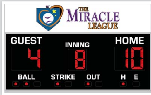
Scoreboard Design for Miracle League