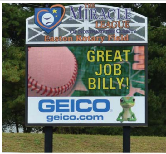
Miracle League of Northampton County