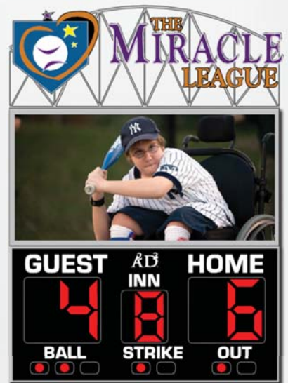
Scoreboard Designs for Miracle League