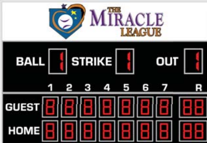
Scoreboard Design for Miracle League

A2D3 ® DIGITAL SCOREBOARD & VISUAL DISPLAY SOLUTIONS By Everbrite and D3 LED